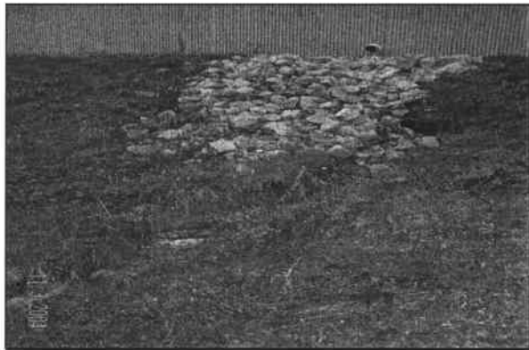
Slopes downstream from roofdrains