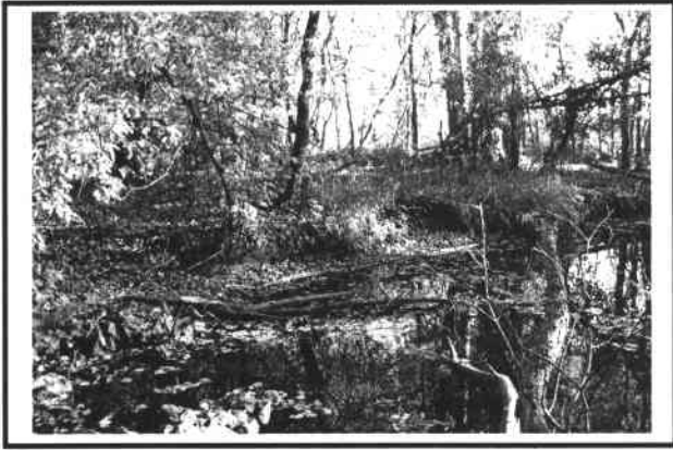
Outlet channel showing downcutting and erosion, woody debris