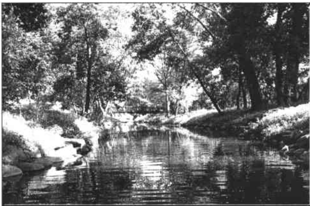
Brunswick pedestrian bridge

Comments: Brunswick removal and ped bridge crossing complete. Zane crossing still under construction, completion expected fall 2004.