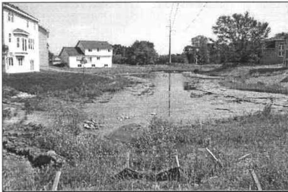
Pond 1 - looking southeast

Pond 4 - Locate inlets. Confirm that pond outlet structure was constructed as designed.