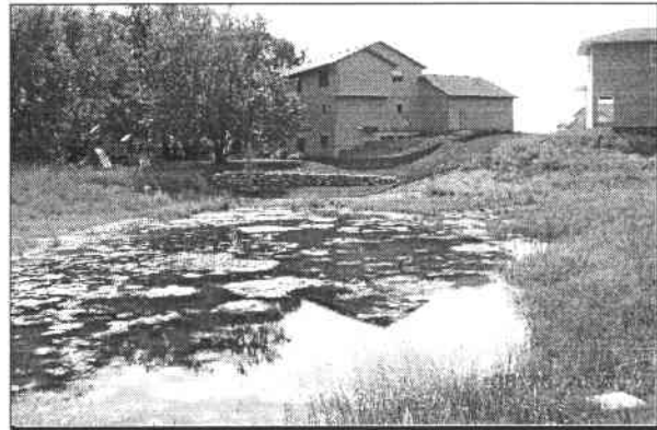
Pond 2 - southeast of pond