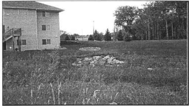
Pond 4 - looking northwest - outlet grate looks high