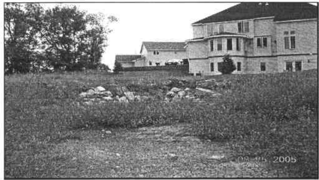
Pond 4 - inlet pipe buried?