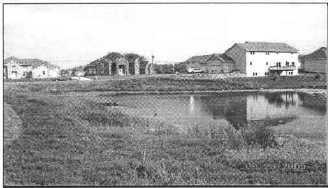
Pond 3 - looking southeast