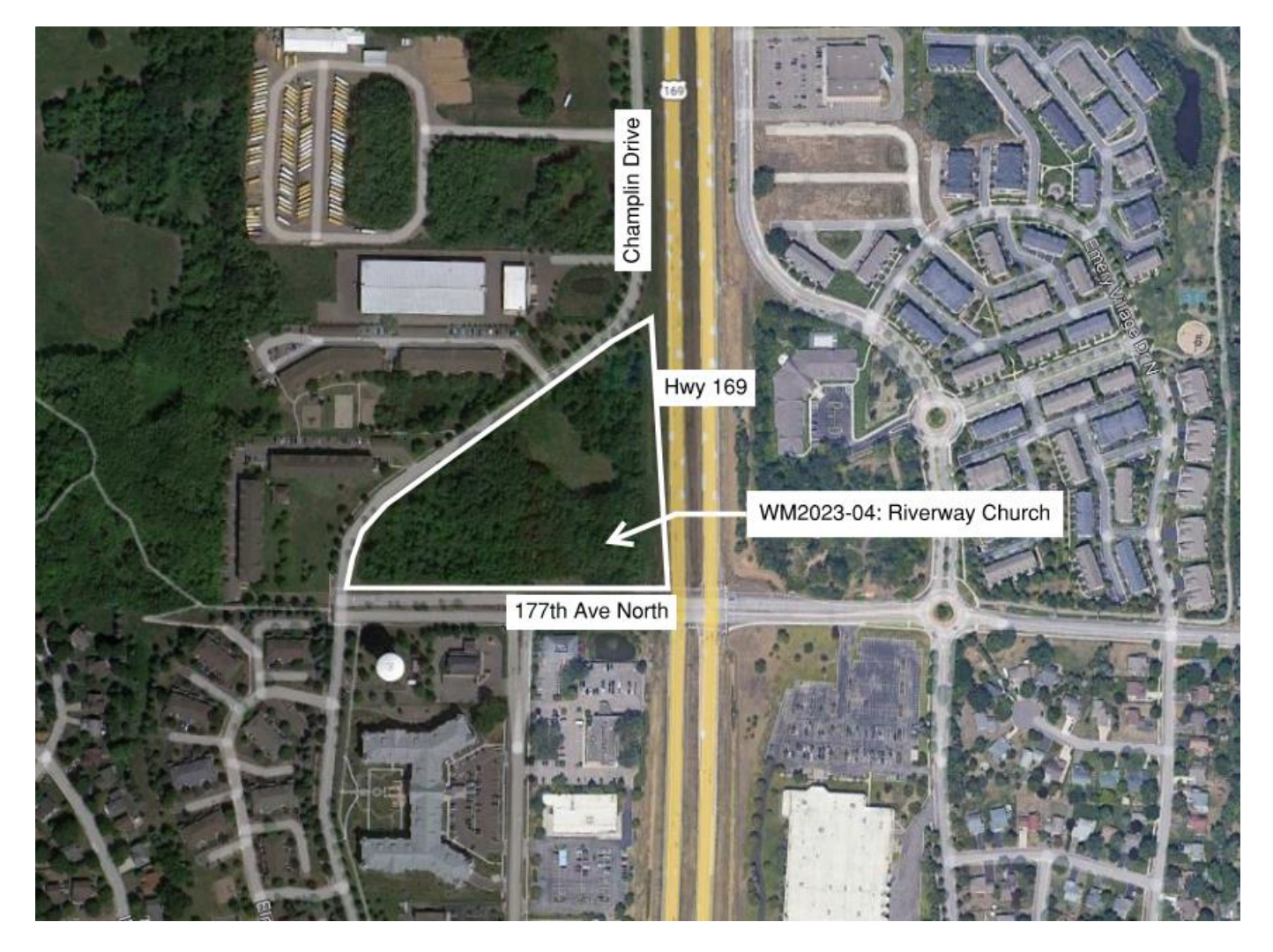
Figure 1. Site location.