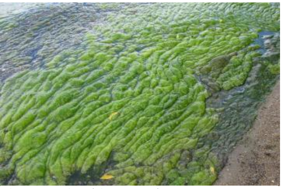
Filamentous algae.

Filamentous algae blooms are masses of long, stringy, hair-like strands. Usually green in color, they may be yellow, grayish or brown. They grow on the surface of hard objects, but they can break loose and form floating mats. These algae are quite different than other common aquatic vegetation. These algae strands are made up of individual cells that are bound together to form the filaments. These cells take up nutrients directly from the water, not from the sediment through roots.