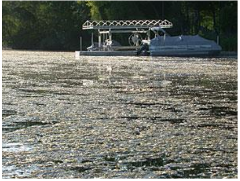
Filamentous algae bloom

Spring filamentous algae blooms are not uncommon after lake nutrient management such as an alum treatment. Water clarity is increased, which allows more sunlight to filter through to the lake bottom. Typical alum treatments only target the deepest lake sediments. However, under the right conditions, phosphorus in spring runoff or early-season sediment release can kick start filamentous algal growth. Scientists and lake managers are experimenting with applying a light dose of alum in the shallow areas to try to limit this response. The Shingle Creek Watershed Management Commission will consider this approach on future alum treatments.