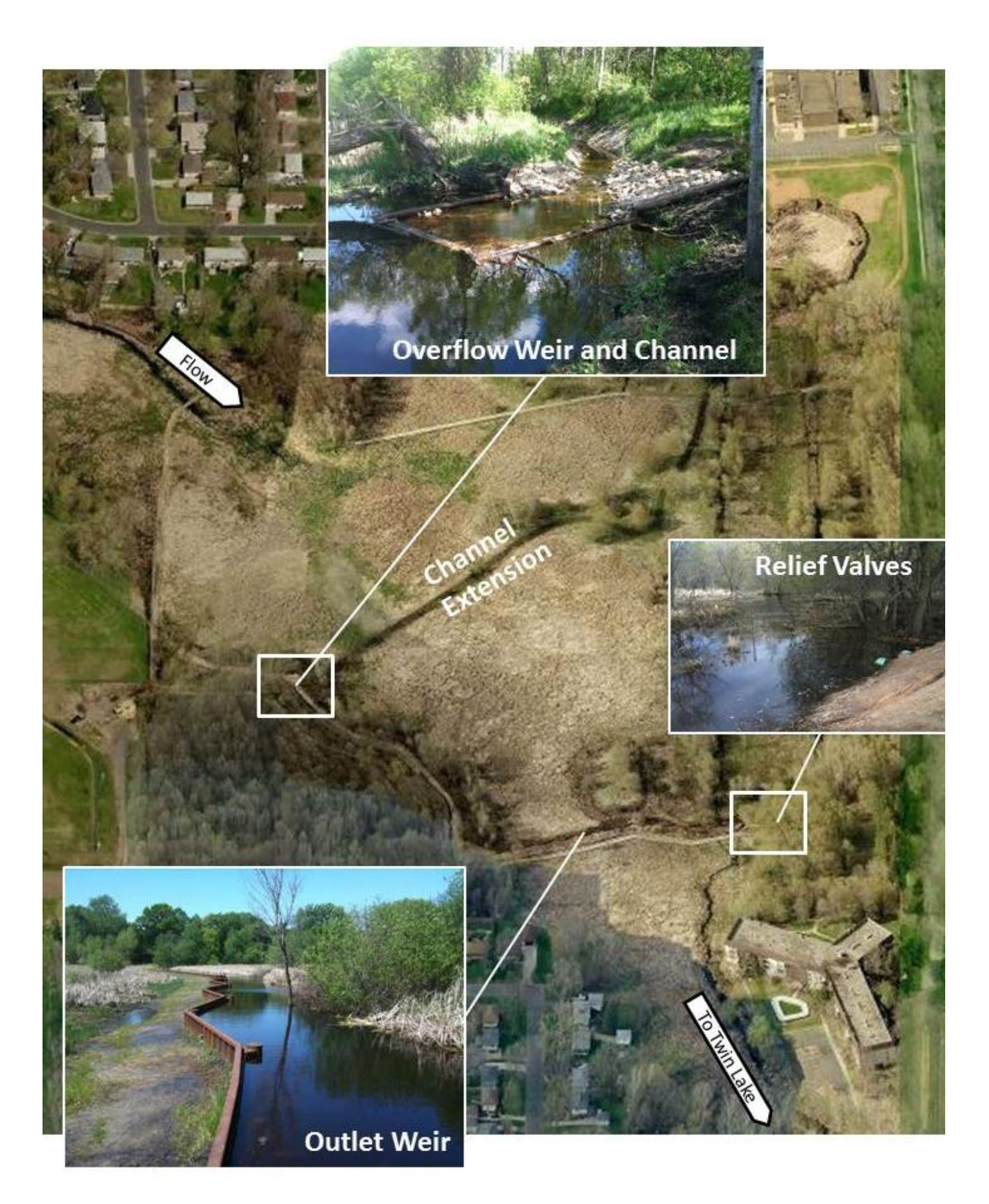
Figure 1. Wetland 639W outlet modification components.