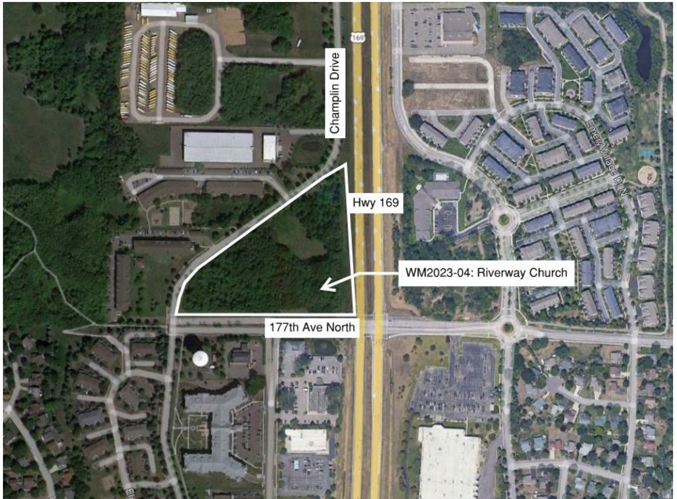
Figure 1. Site location.