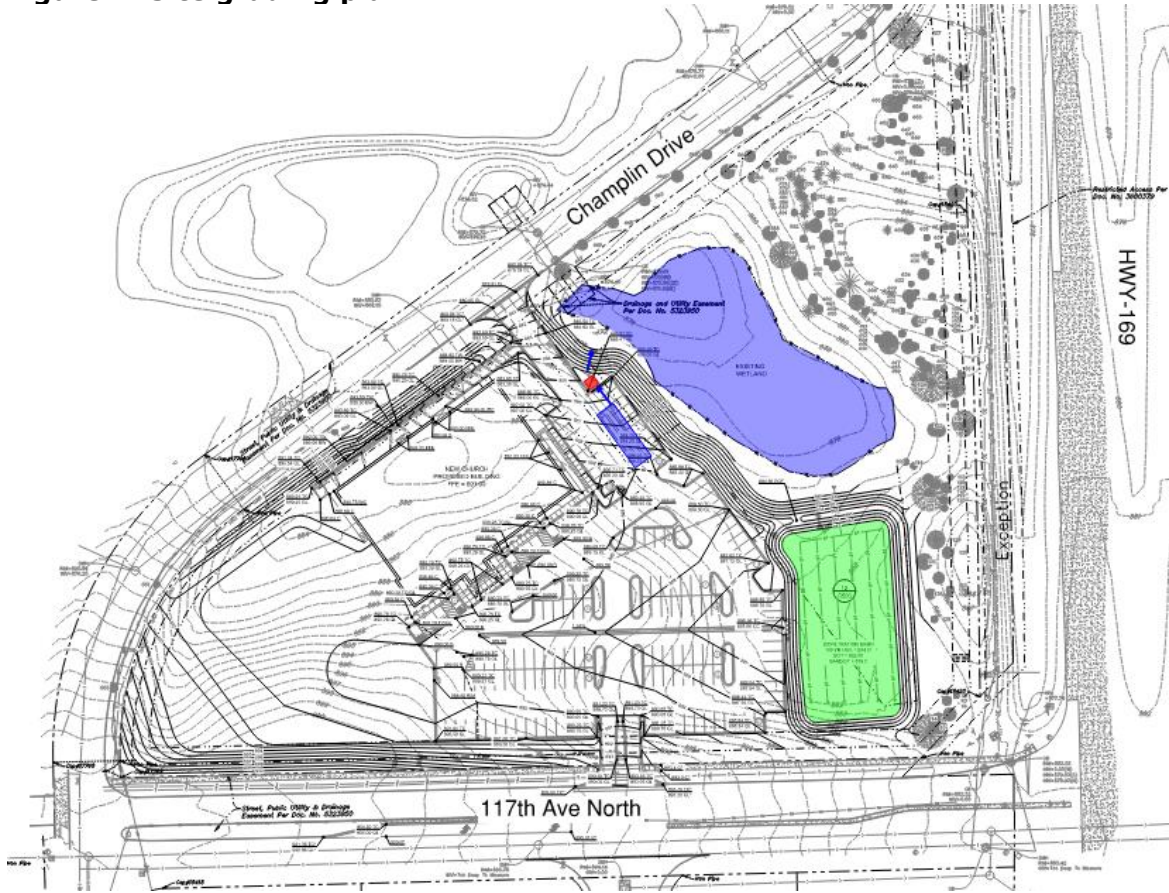
Figure 2. Site grading plan.