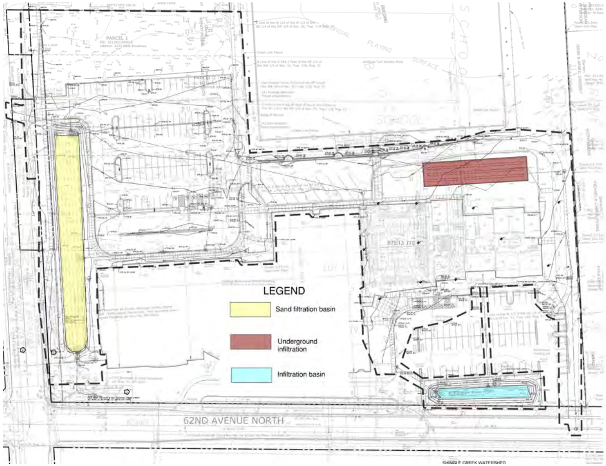
Figure 2. Site grading plan.