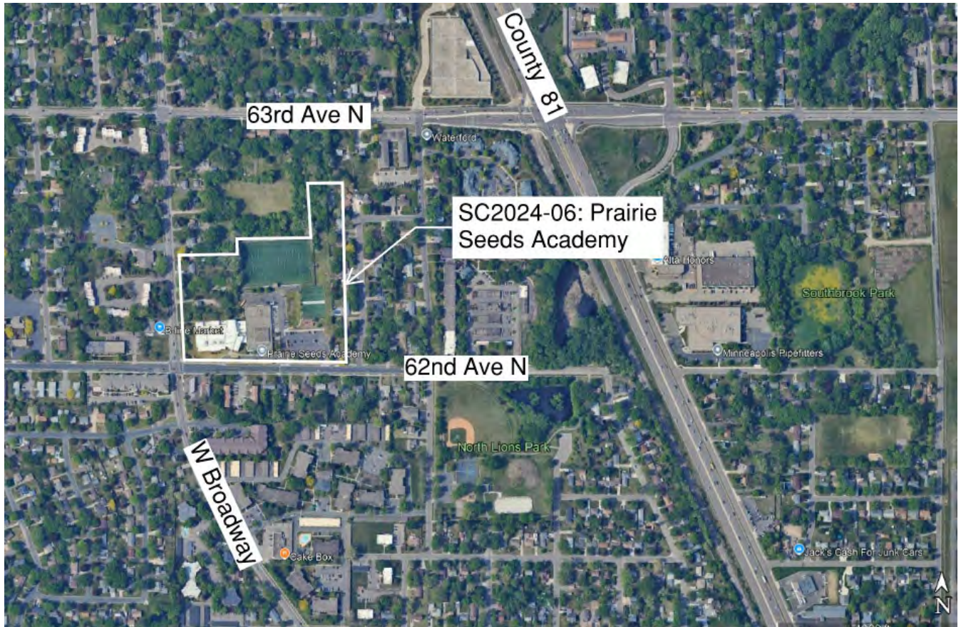
Figure 1. Site location.